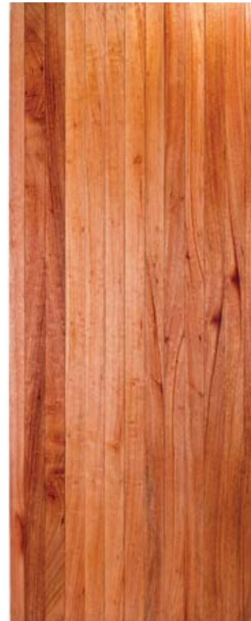
BB Tongue & Groove Meranti No Finger Joint Code: 82106