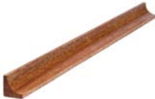
38mm Meranti Scotia Finished Size 40x30mm MSC032