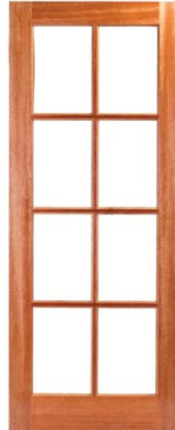
Elite 8 Light (No Glass) Engineered Meranti Code: ST8L

Dimensions of doors on this page are 813x2032x40mm Unless shown otherwise