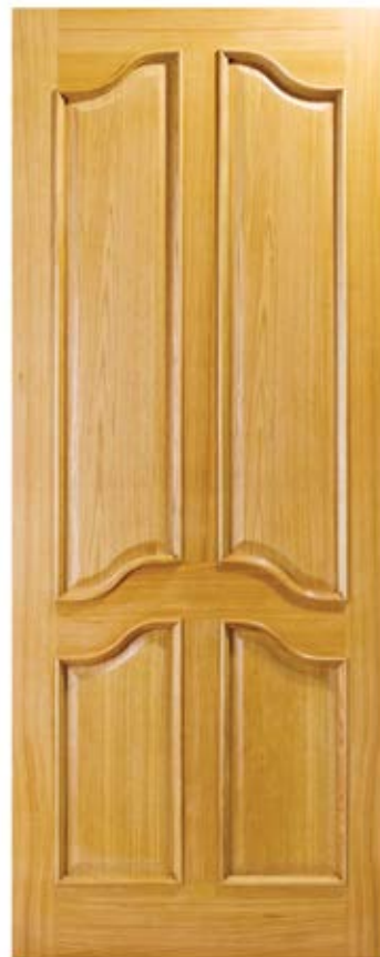
Richelieu 4 Panel Bolection Mould Code: RICHBM