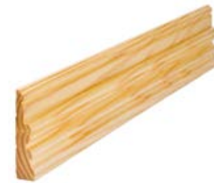
Pine Roman 100x19mm (Finger Jointed) ROM89