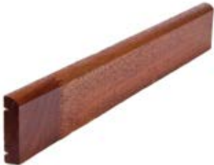
Meranti Fuller Skirting 67x17mm MS017