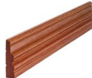
Roman 87x21mm (No Finger Joint) ROMM87