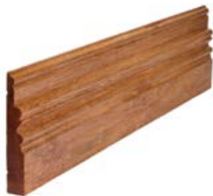
Roman 120x21mm (No Finger Joint) ROMM120