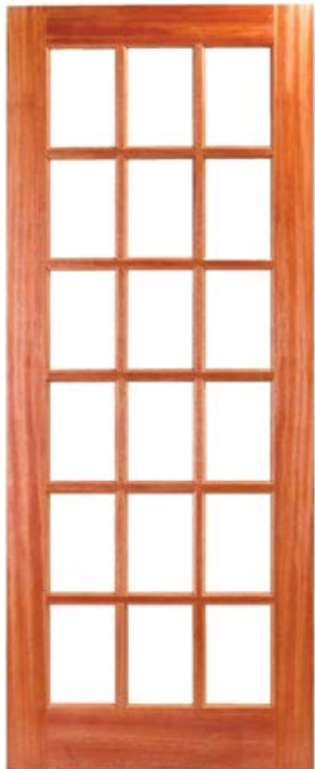
Elite 18 Light (No Glass) Engineered Meranti Code: GD0118