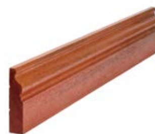
Regency 87x21mm (No Finger Joint) REGM87