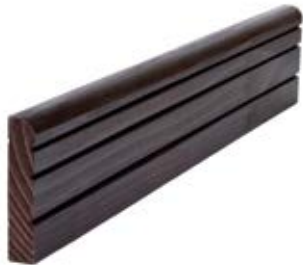
Pine Contemporary Indonesian Teak Coated 100x19mm 100PFCONT