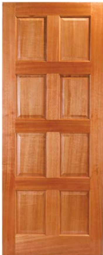
Elite 8 Panel Engineered Meranti Code: SIT138