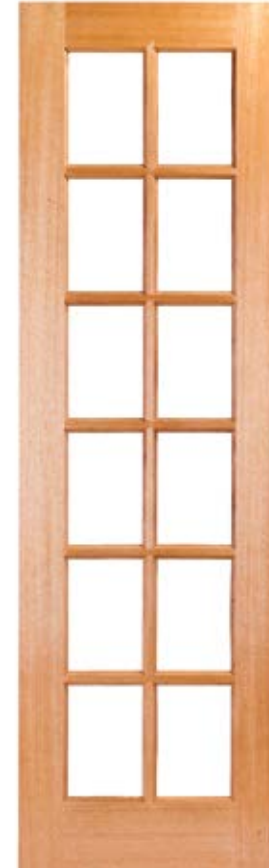
Elite 12 Light (No Glass) Engineered Meranti 610x2032x40mm Code: GD0610

Dimensions of doors on this page are 813x2032x40mm Unless shown otherwise