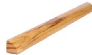
38mm Pine Quadrant Clears Finished Size 42x30mm PQ032