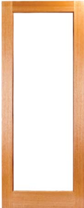
Elite 1 Light (No Glass) Engineered Meranti Code: GD03