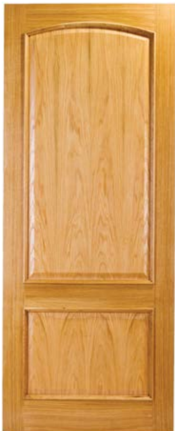
Ibiza 2 Panel Bolection Mould Code: IBIZBM