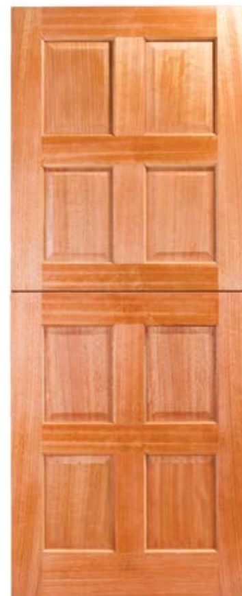
Elite 8 Panel Stable Engineered Meranti Code: SIT138S

Dimensions of doors on this page are 813x2032x40mm Unless shown otherwise