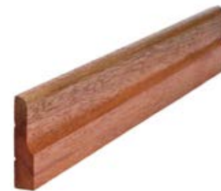
Edwardian 87x21mm (No Finger Joint) EDM87