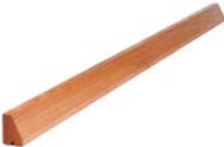
38mm Meranti Weather Bar 813mm MWB