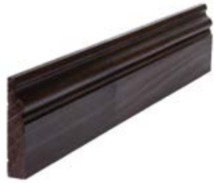
Pine Regency Indonesian Teak Coated 100x19mm 100PFREG