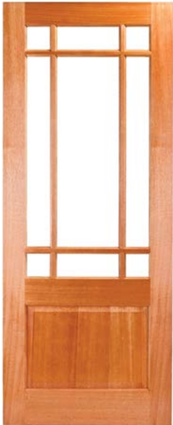
Elite Happy (No Glass) Engineered Meranti Code: SR139