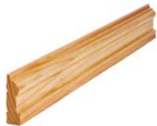
Pine Victorian 67x19mm (Finger Jointed) VP67