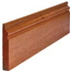
Regency 140x21mm (No Finger Joint) REGM140