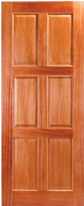
Elite 6 Panel Engineered Meranti Code: SIT136