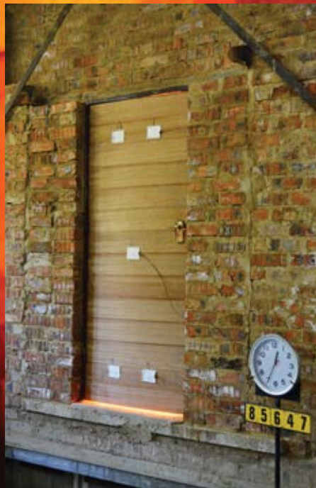
Exterior at 35 minutes into test