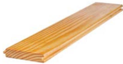
114mm Tongue & Groove V-Jointed Pine Flooring Finished Size 100x21mm PF102