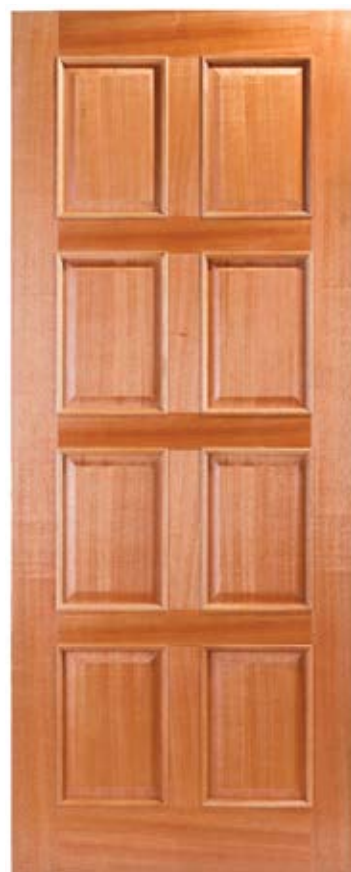
Elite 8 Panel Engineered Bolection Mould Code: ST8BM