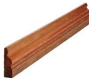
Regency 67x21mm (No Finger Joint) REGM67