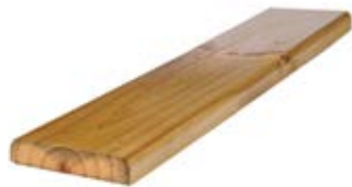
Pine Decking - CCA Treated 22x102mm PDT102