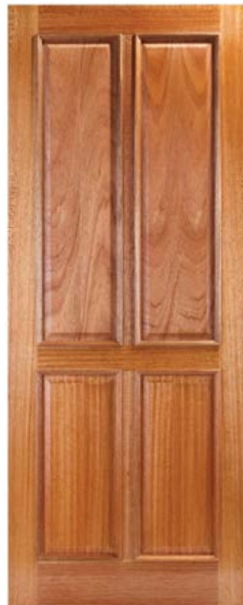
Elite 4 Unequal Panel Engineered Bolection Mould Code: SR134E