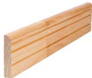
Pine Contemporary 100x19mm (Finger Jointed) CP100