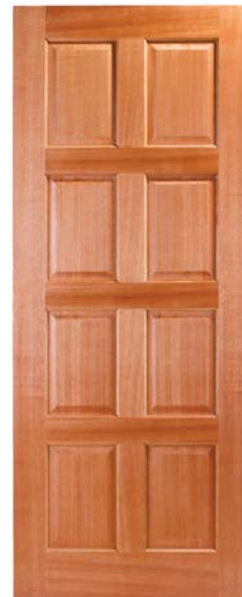
Elite 8 Panel Engineered Bolection Mould Code: ST8BM

Dimensions of doors on this page are 813x2032x40mm Unless shown otherwise