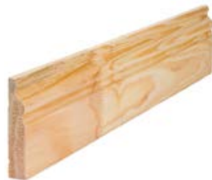
Pine Regency 100x19mm (Finger Jointed) R100