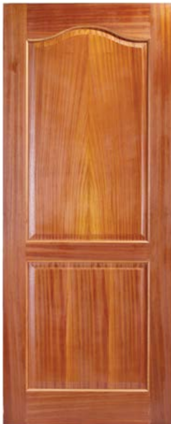
Elite 2 Panel Engineered Cape Dutch Bolection Mould Code: ST102CDBM