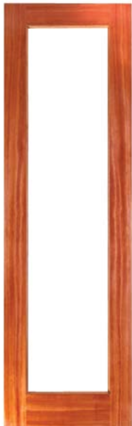
Elite 1 Light Full Glass (No Glass) Engineered Meranti 610x2032x40mm Code: GD03610