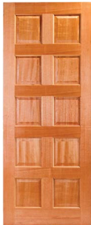
Elite 10 Panel Engineered Meranti Code: SIT1310