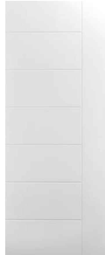
White Primed Contemporary 7 Horizontal 1 Vertical Hollow Core Code: 7PRIM

Dimensions of doors on this page are 813x2032x40mm Unless shown otherwise