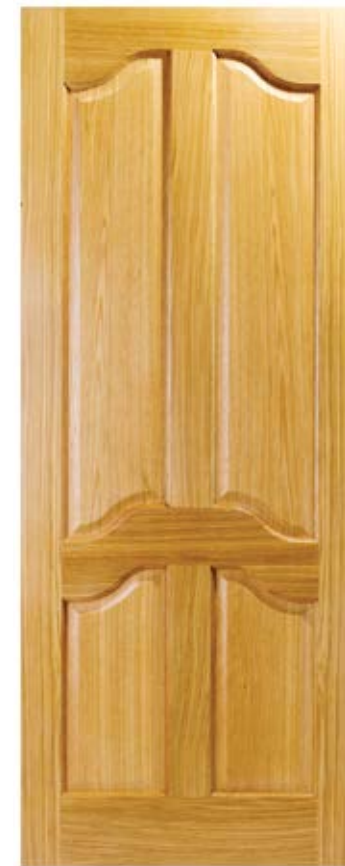
Richelieu 4 Panel Bolection Mould Code: RICHBM

Dimensions of doors on this page are 813x2032x35mm Unless shown otherwise