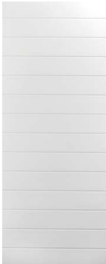
White Primed 14 Panel Horizontal Slatted Hollow Core Code: 14PRIM