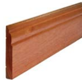
Gothic 140x21mm (No Finger Joint) GEOM140