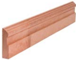
Meranti Victorian 89x18mm (Finger Jointed) MV89