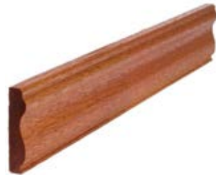
Meranti Architrave 89x18mm (Finger Jointed) MS094