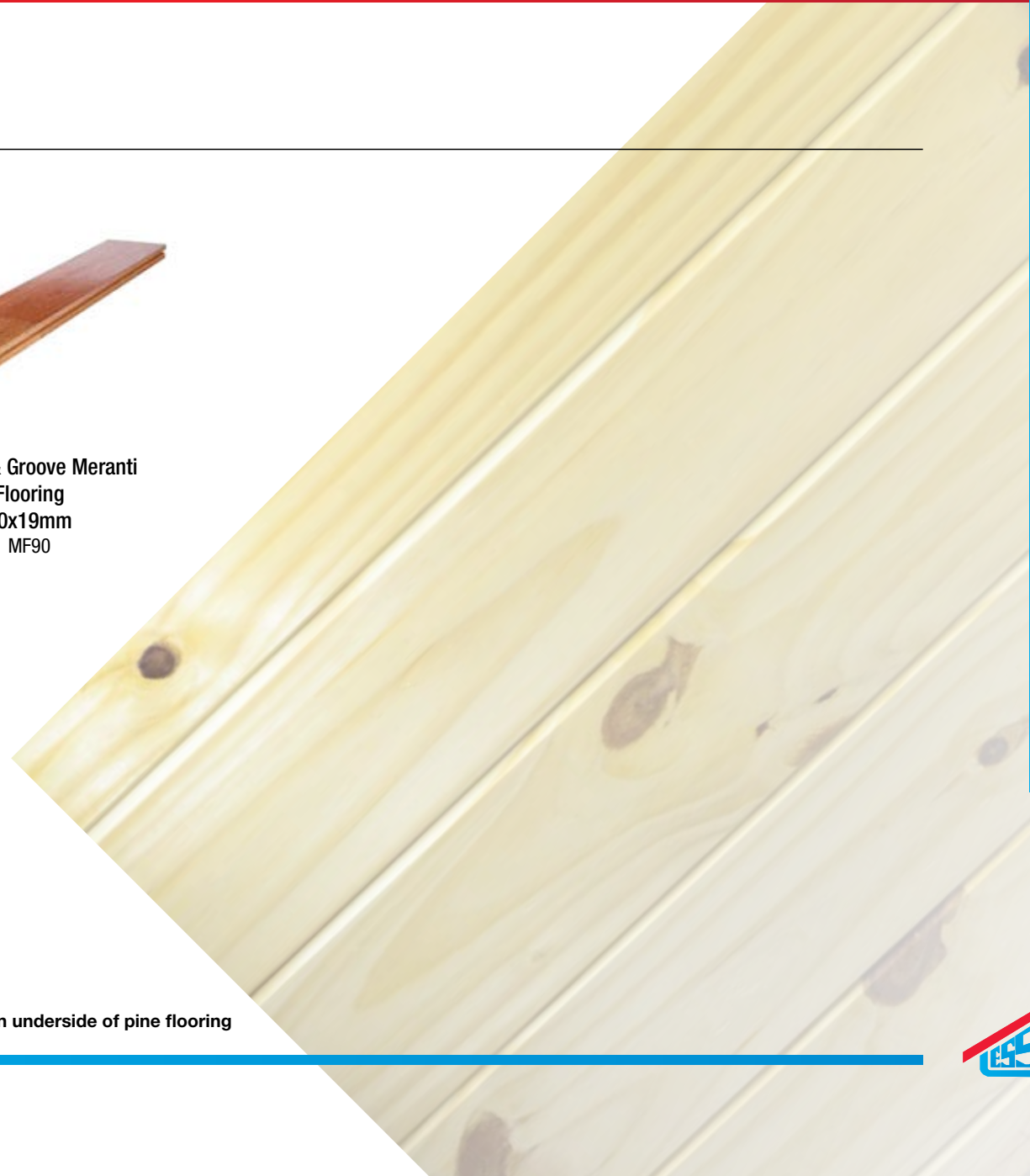
V-Joint on underside of pine flooring