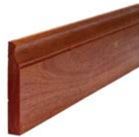
Georgian 140x21mm (No Finger Joint) GRGM140