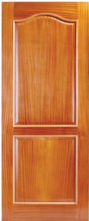
Elite 2 Panel Engineered Cape Dutch Bolection Mould Code: ST102CDBM