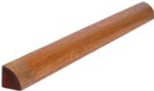
38mm Meranti Quadrant Finished Size 42x30mm MQ032