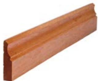
Georgian 87x21mm (No Finger Joint) GRGM87