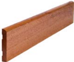
102mm Meranti Skirting Finished Size 95x15mm MS095