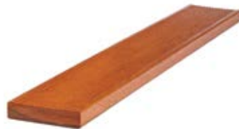
Balau Kiln Dried Reeded Reversible 19x90mm BD1990