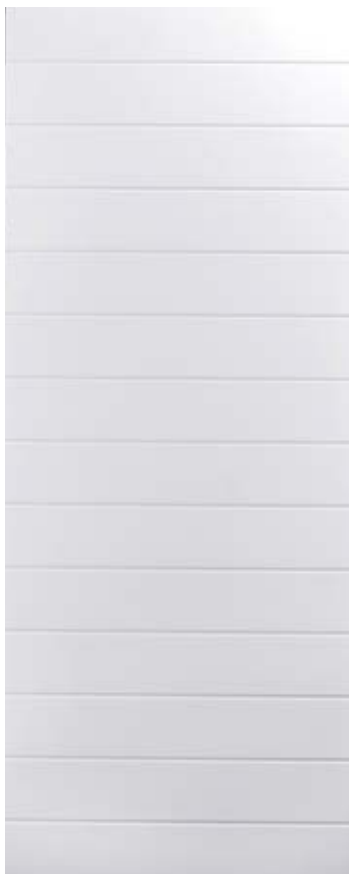
White Primed 14 Panel Horizontal Slatted Hollow Core Code: 14PRIM