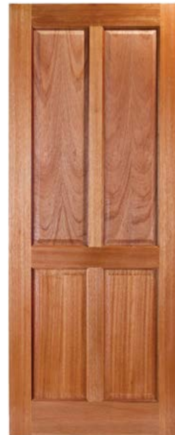
Elite 4 Unequal Panel Engineered Bolection Mould Code: SR134E

Dimensions of doors on this page are 813x2032x40mm Unless shown otherwise