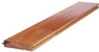
Tongue & Groove Meranti Flooring 90x19mm MF90