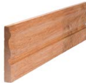
Meranti Skirting / Architrave 138x18mm (Finger Jointed) MS145