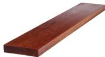
Meranti (No Finger Joint) & Pine Clears Planed all round (PAR) Various sizes and lengths PAR