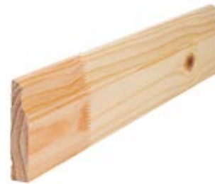
Pine Georgian 100x19mm (Finger Jointed) GP