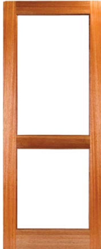
Elite 2 Light (No Glass) Engineered Meranti Code: GD05