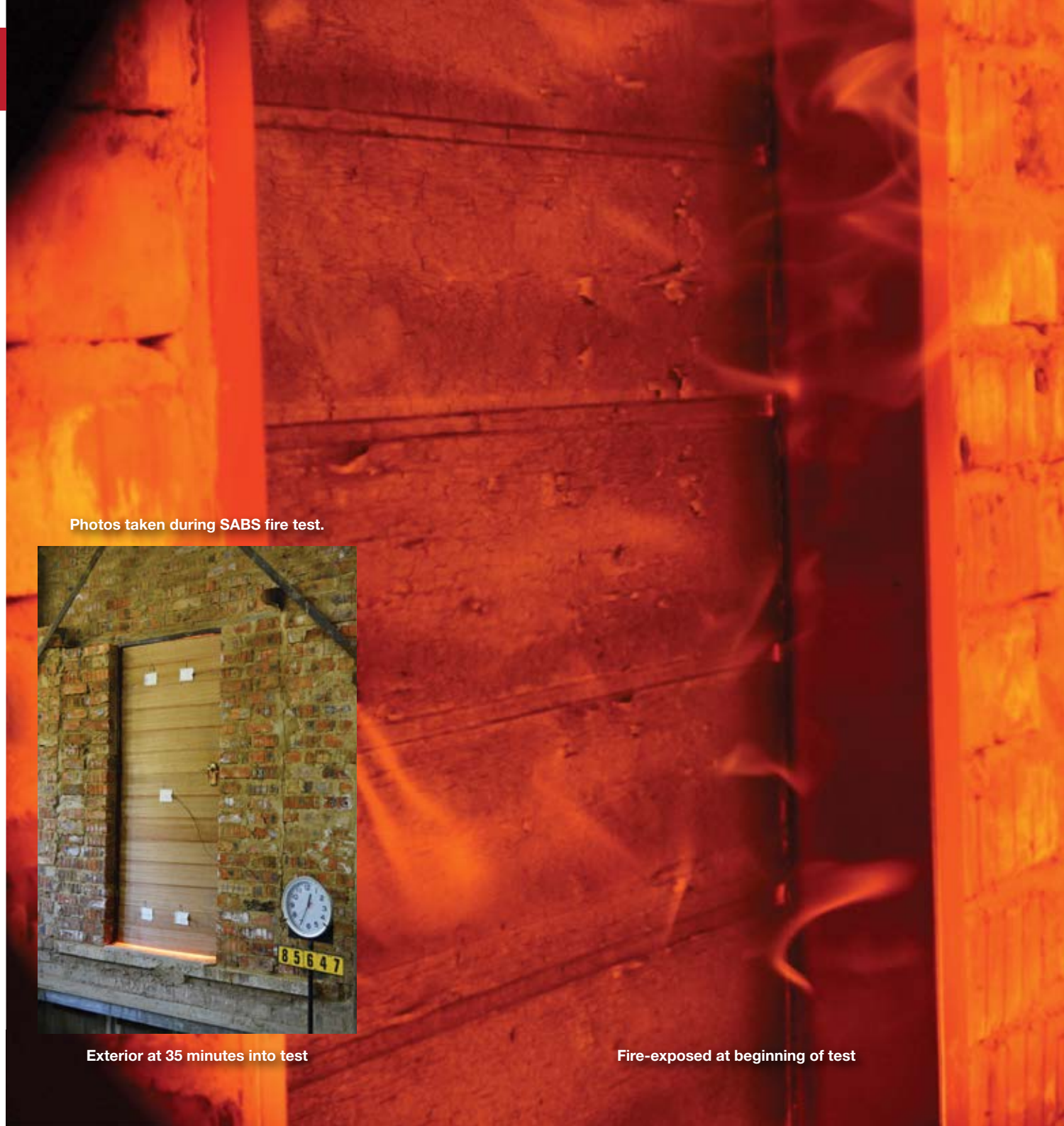
Fire-exposed at beginning of test