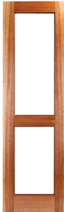
Elite 2 Light (No Glass) Engineered Meranti 610x2032x40mm Code: GD05610