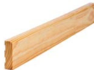
76mm Pine Skirting Finished Size 67x21mm PS070