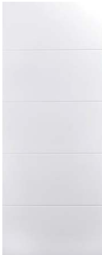
White Primed 5 Horizontal Hollow Core Code: 5PRIM