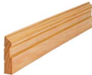
Pine Victorian 100x19mm (Finger Jointed) VP89