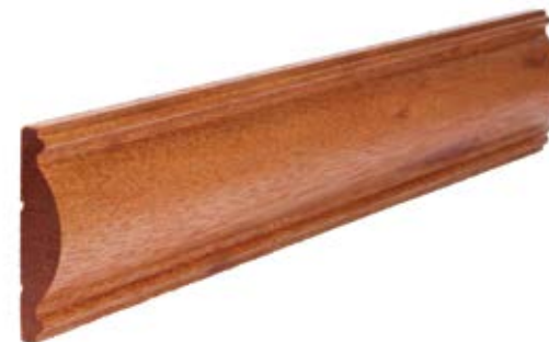
Dado Rail 90x20mm (No Finger Joint) DADM92