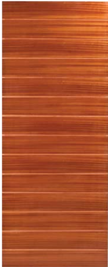
Fire Horizontal Slatted Wide Board Meranti Solid Engineered Code: STHZ