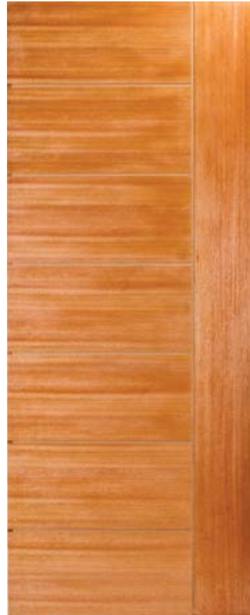
Fire Contemporary 7 Horizontal 1 Vertical Meranti Solid Eng Code: 7H/1V