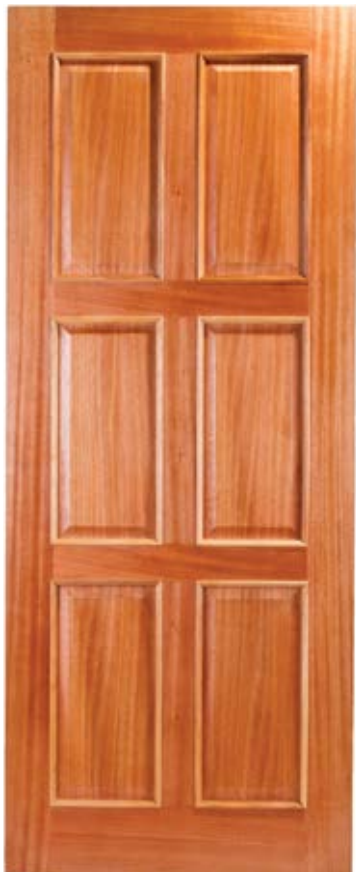
Elite 6 Panel Engineered Bolection Mould Code: ST6BM