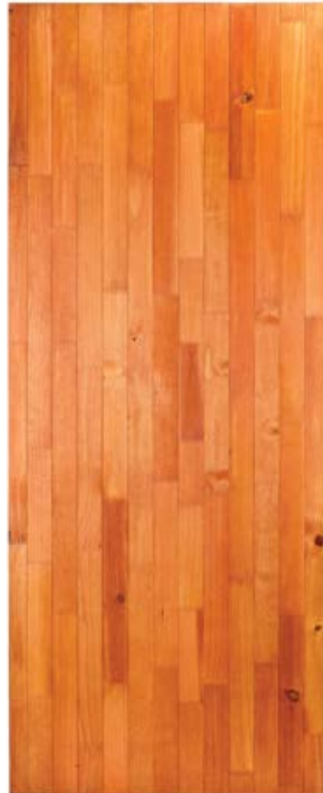
BB Pine Tongue & Groove Stained Finger Jointed Code: 82060