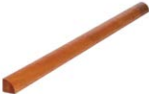
25mm Meranti Quadrant Finished Size 25x19mm MQ021