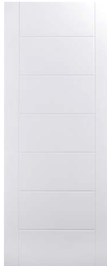
White Primed 7 Horizontal 2 Vertical Hollow Core Code: 7H2VPRIM

Dimensions of doors on this page are 813x2032x40mm Unless shown otherwise