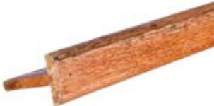
Meranti T-Bar 2100mm TB