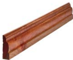
Gothic 67x21mm (No Finger Joint) GEOM67