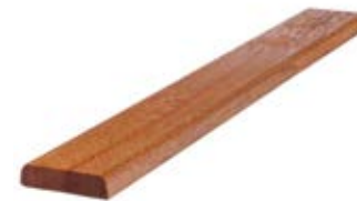
Meranti Decking Finger Jointed 17x70mm MD70