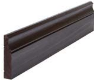
Pine Georgian Indonesian Teak Coated 100x19mm 100PFGEO