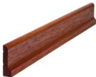
Edwardian 67x21mm (No Finger Joint) EDM67