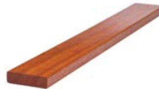
Balau Kiln Dried Decking 19x70mm BD1970