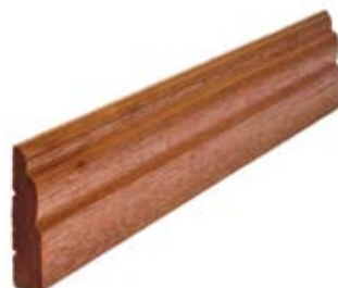
Gothic 87x21mm (No Finger Joint) GEOM87