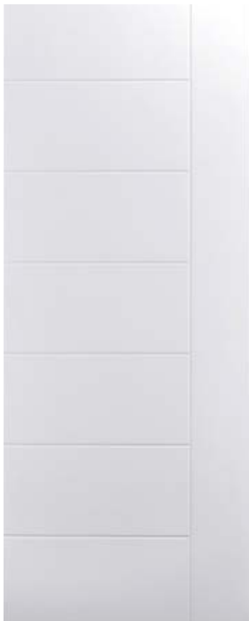
White Primed 7 Horizontal 1 Vertical Hollow Core Code: 7PRIM