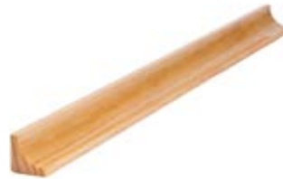
38mm Pine Scotia-Clears Finished Size 42x30mm PSC032