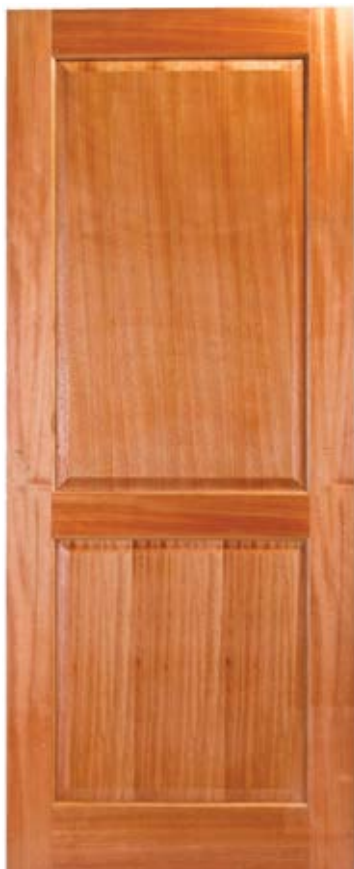
Elite 2 Panel Engineered Meranti Code: ST102