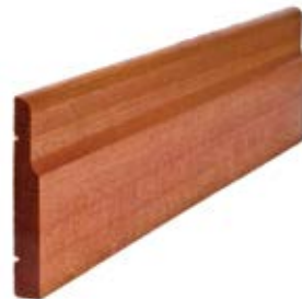
Edwardian 140x21mm (No Finger Joint) EDM140