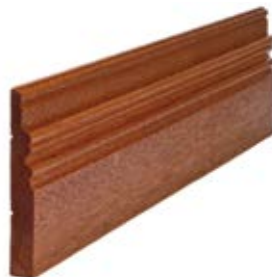
Roman 140x21mm (No Finger Joint) ROMM140