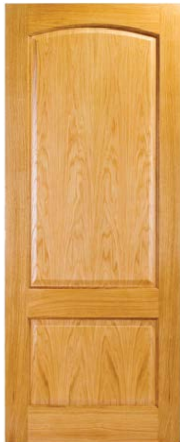
Ibiza 2 Panel Bolection Mould Code: IBIZBM